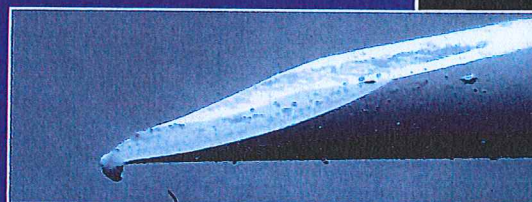
NEEDLE USED TWICE